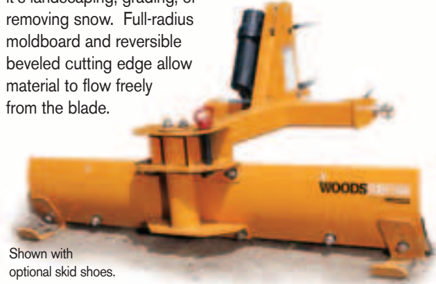
Shown with optional skid shoes.

Our rear blade creates a smooth clean surface whether it's landscaping, grading, or removing snow. Full-radius moldboard and reversible beveled cutting edge allow material to flow freely from the blade.