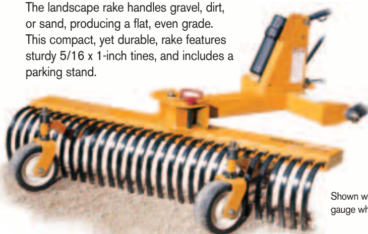
Shown with optional gauge wheels.

The landscape rake handles gravel, dirt, or sand, producing a flat, even grade. This compact, yet durable, rake features sturdy 5/16 x 1-inch tines, and includes a parking stand.